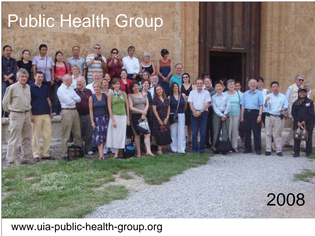
2008 in Florence Italy.